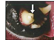
Fracture with Pulp Exposure

If the root is intact, root canal therapy is sometimes recommended to save the tooth. Root canal therapy is less invasive, less painful and heals faster than an extraction.