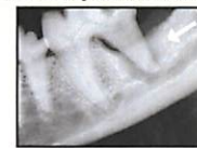
Hidden Bone Loss