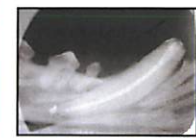
Root Canal Therapy